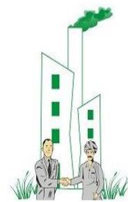
For Manufacturers ( उत्पादक )