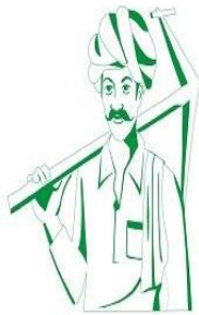
For Farmers ( किसानों के लिए )

मुख्य पृष्ठ दुकान हमारे बारे में ज्ञान भंडार ★ पंजीयन संपर्क करें