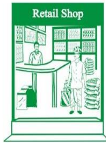
For Retailers ( वितरक )