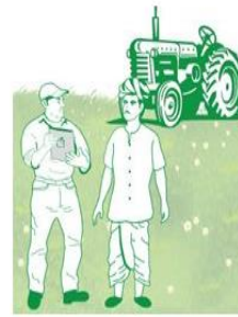
For Service Providers ( सेवा प्रदाता )