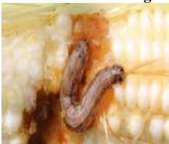
Cob tip Damage