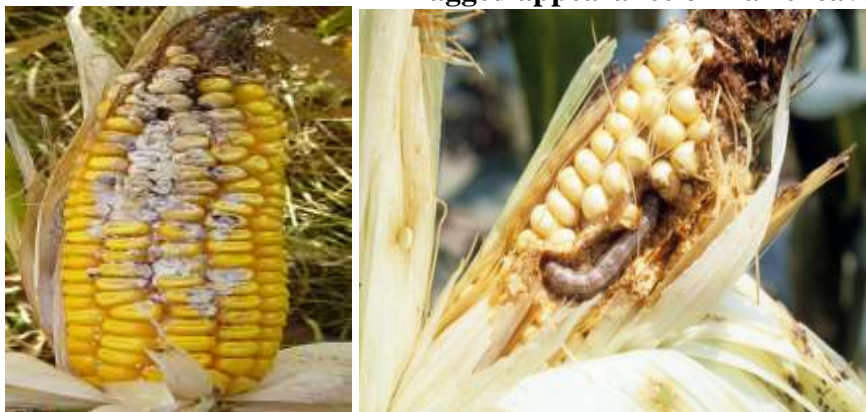
Fall Armyworm damaged cob