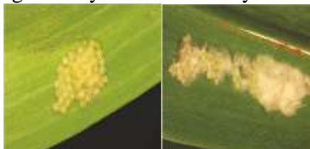
Fall Armyworm Egg masses