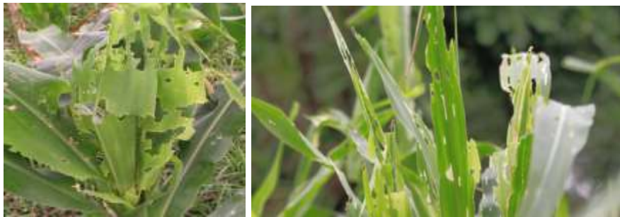
Ragged appearance of maize leaves