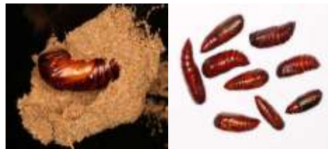
Fall Armyworm pupa